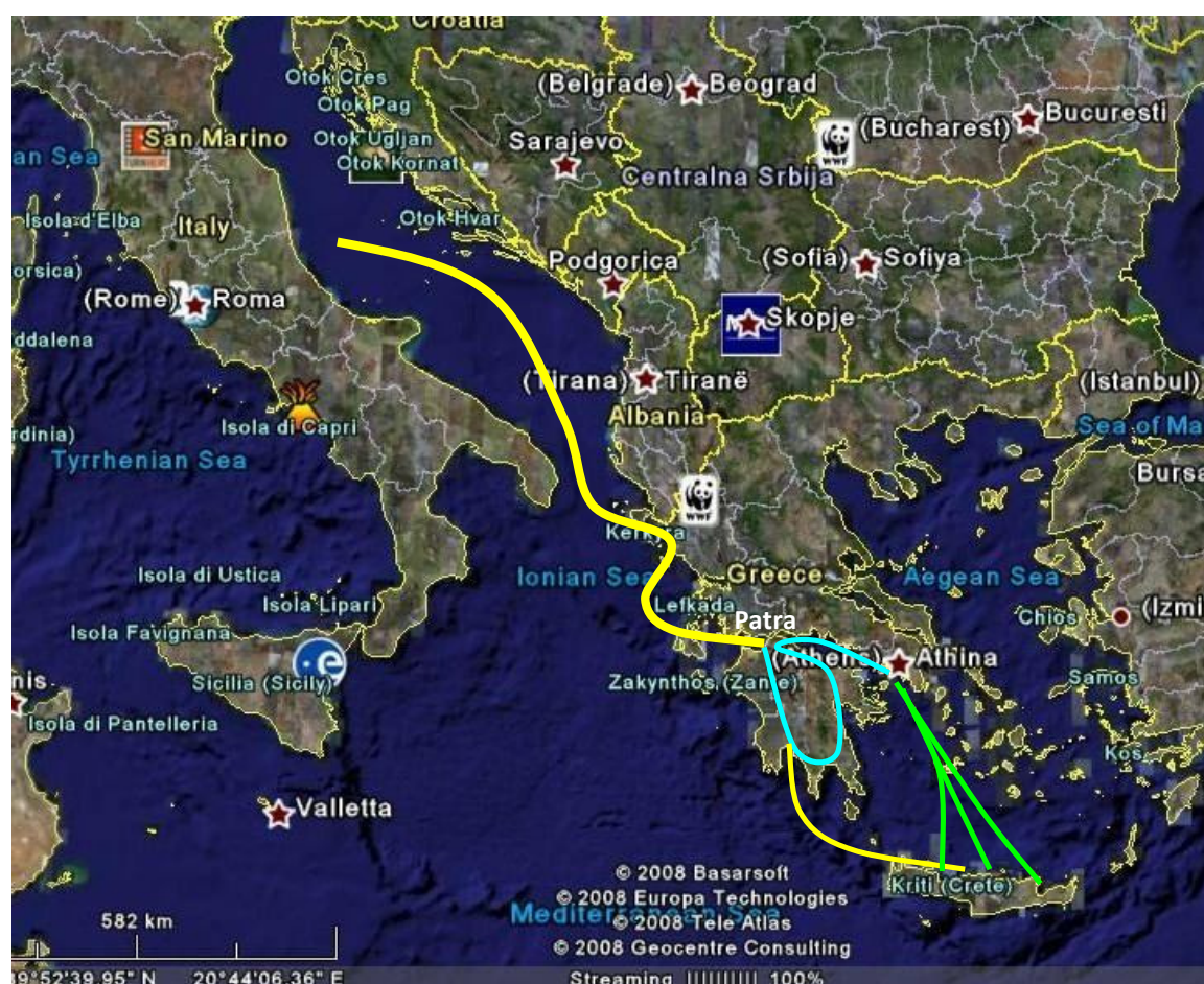
Map 1. Current situation and proposed network configuration

Therefore, the proposed alternative service solution is related to new “business models”. In order to promote the proposed solution, the study investigates a business model on the basis of a service offering with two packages: a) the “direct transport to