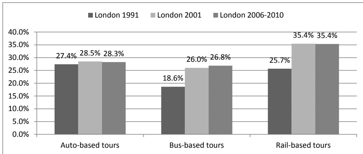
Figure 2 - Share of complex chain by mode