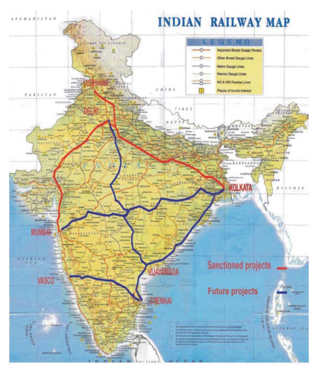
Fig. 1. DFC Route map [Qazi and Tahilramani, 2017]