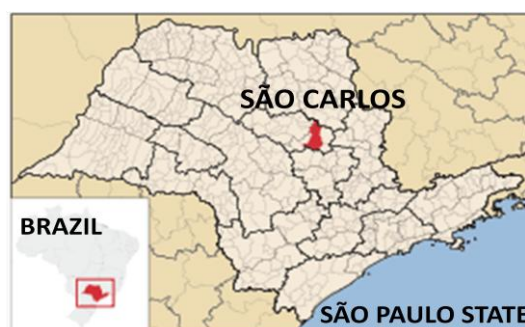
Figure 2: Location of São Carlos

This study was conducted in the city of São Carlos, located at São Paulo State in Brazil (Figure 2). According to IBGE (Brazilian Institute of Geography and Statistics) the city has an estimate for 2009 of 220,463 inhabitants, and a territorial area of 1141km 2 . São Carlos has a fleet of almost 120,000 vehicles: 76% automobiles, 20% motorcycles, and 4% trucks and buses (DENATRAN – National Traffic Department, 2009).