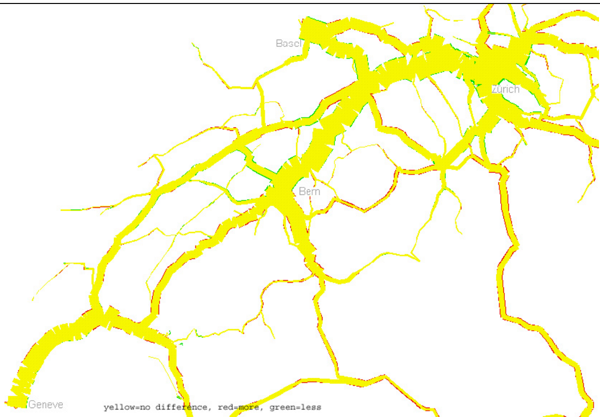
Figure 3 Absolute differences in the link volume: SP-based forecast and traffic counts [Railway network]