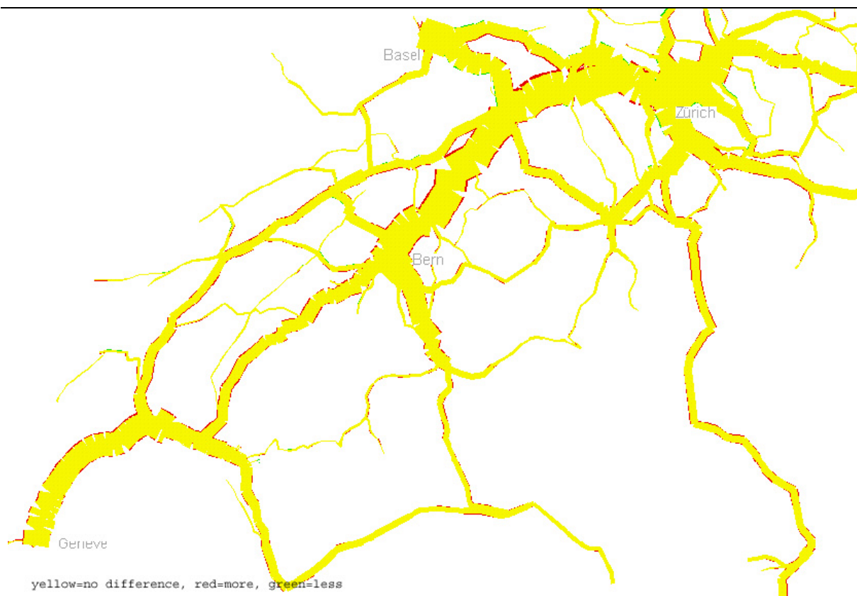
Figure 2 Before-model: Comparison of assignment results with counts after calibration [Railway network]

The road model includes 7426 nodes, 10240 links and 3066 zones of which 2975 zones are within Switzerland. The internal zones correspond to the municipalities. Large cities were divided into several zones. An average daily working-day origin-destination matrix previously developed for the ARE (Fusseis and Sigmaphan, 1998) was assigned to obtain a deterministic user equilibrium solution and calibrated to the available traffic counts. See for a comparison of differences after the automatic calibration.