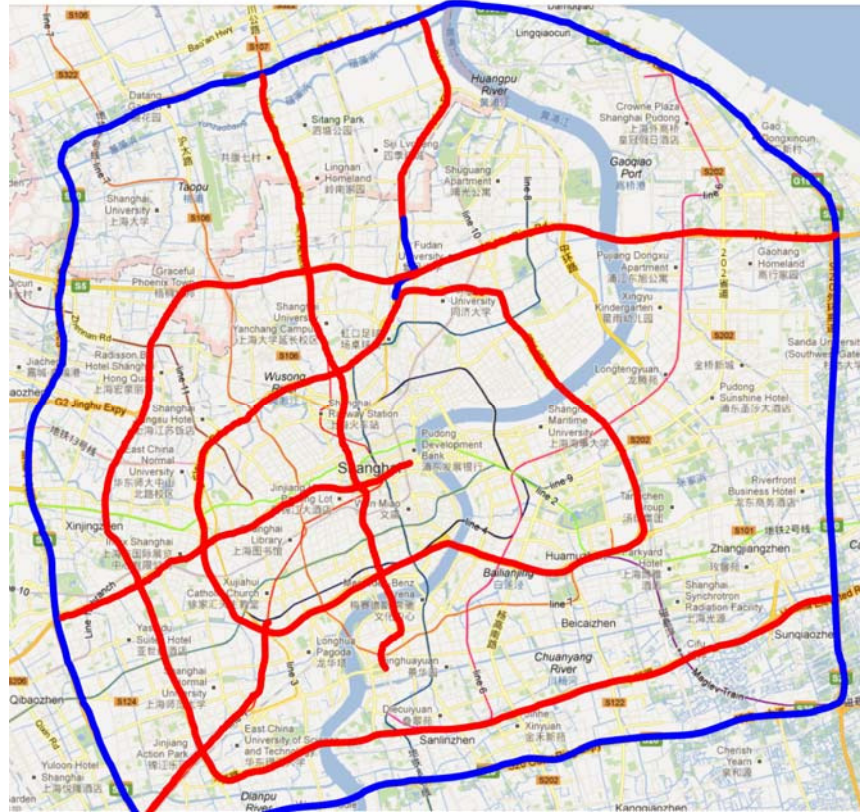
FIGURE 1 Peak hour restricted elevated roads for non-local vehicles (Shanghai Municipal Public Security Bureau, 2011)

A city's capacity in controlling non-local vehicles is the key to successful implementation of car ownership policy. As one of the leading cities in China, Shanghai has the capacity and power to pose harsher restrictions, yet Shanghai has hesitated to step forward. By posing further restrictions, Shanghai would have to sacrifice its openness as a city that is one of the most important features for maintaining city competitiveness (Clark, 2010). An open city could create a labor pool in supporting public infrastructure and services, attracting different skill sets to boost the city economy in different sectors, fostering economic internationalization and specialization, and attracting innovators, investors, visitors, and residents. Also, openness of a city needs to be two-way, having low barriers of entry and exit (Clark, 2010). Shanghai's debate around openness is not only a local issue, but also a conflict with other cities. Closing Shanghai's boundary to outsiders may also affect nearby cities. Thus, the art of balancing congestion mitigation versus openness as a city has made non-local vehicle management more difficult. Further restriction may also raise public concern given the high penetration of non-local vehicles already in Shanghai. However, previous government restrictions do not offer a full solution to the non-local problems but instead result in a type of business chain in Shanghai.