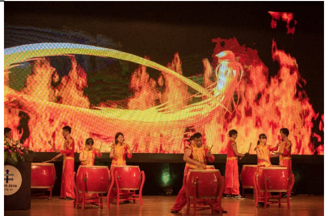
Entertainment at The Gala Dinner