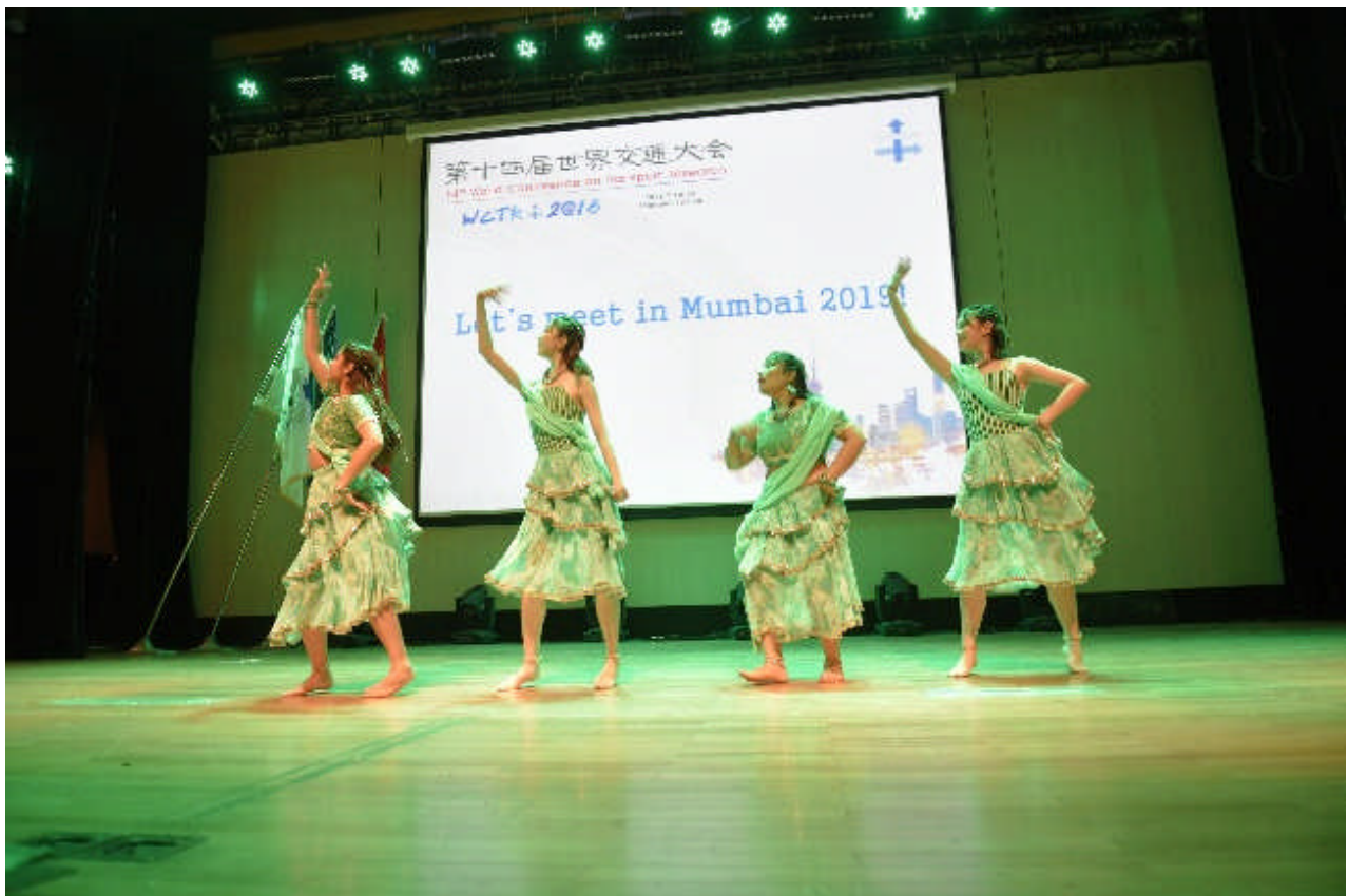
Preparing for WCTR 2019 with a taste of Mumbai